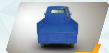
Best-in-class Load Body Length and Loading Area