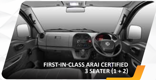
FIRST-IN-CLASS ARAI CERTIFIED 3 SEATER (1 + 2)