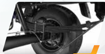
Leaf Springs Front: Parabolic for Superior Comfort Rear: Semi Elliptical for Carrying More Load