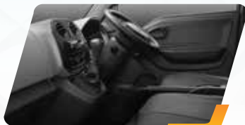
Ergonomic Seats and Controls