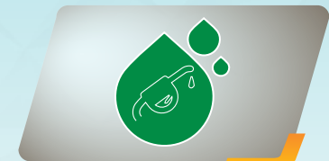
Superior Fuel Efficiency