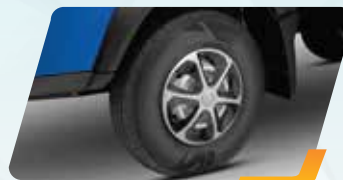
Bigger and Wider Tyres