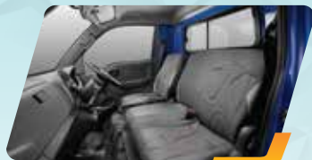
Easy Walkthrough Cabin with Dash Mounted Gear