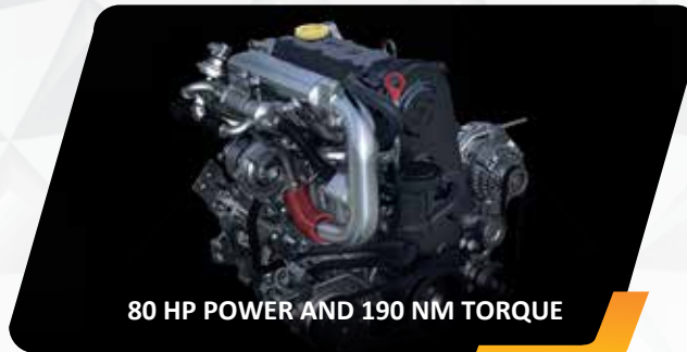
80 HP POWER AND 190 NM TORQUE