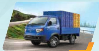
Power Packed for City and Highway Driving; Low Turning Circle Radius